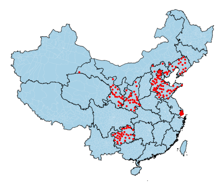
Fig. 1. Geographical Distribution of IDFS Sample Counties. Notes : The red dots in the figure represent sample counties.